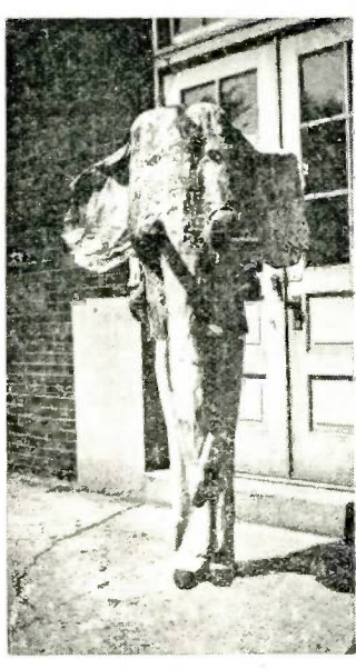
Jumbo, the gigantic elephant. Likes the little folks and wants them all to see him picnic day.

Some of the Strange Sights to be Seen in the Childrens Picnic Day Parade