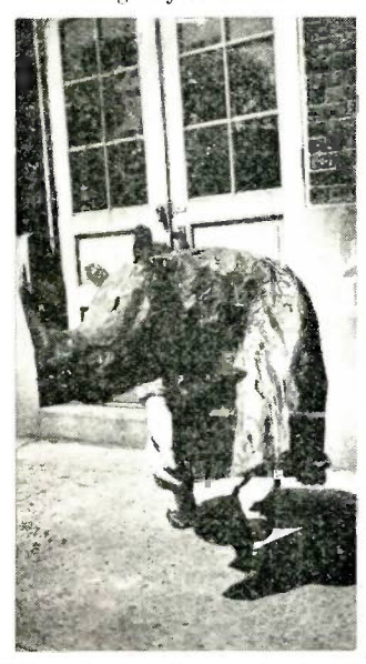
Romeo Rhino, the romping, roaring bad boy of the African jungle.