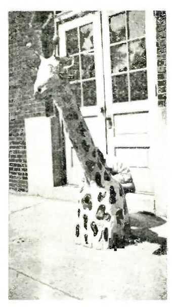
Lilly Longneck, a pretty maiden giraffe, who loves ice cream and lemonade because it has such a long way to travel.