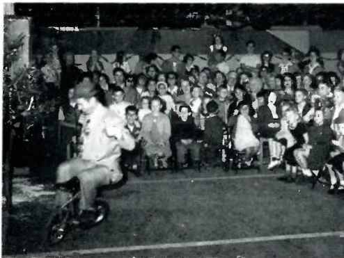
The trick bicycle rider was one of the favorite entertainers at the party given for the children.

There is but one question in the minds of the aforementioned committee, to-wit: "Where will we hold the party next year if we can expect another overflow crowd like that?"