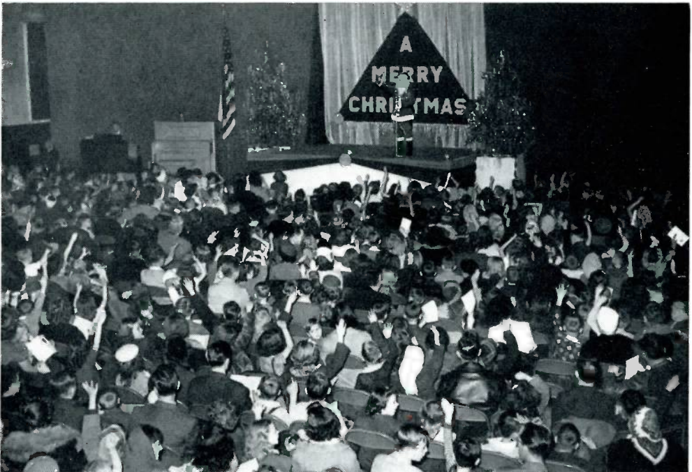
More than 700 children of Mueller Co. employees were on hand to greet Santa Claus as he appeared at the annual Christmas party in the Mueller gymnasium. This photograph shows a section of the enthusiastic audience when the old gentleman came on stage. The program included variety acts, group singing and, of course, treats for all the youngsters who attended.