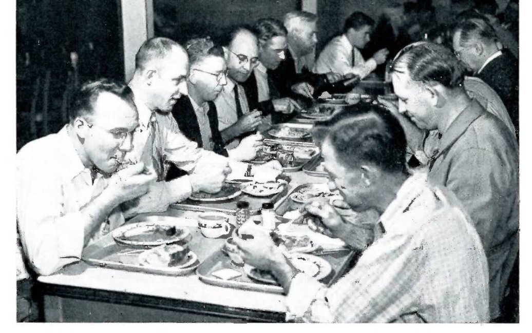
This group of Mueller Co. employees apparently approved the first day's menu.