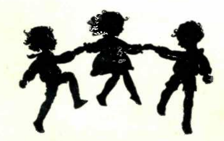
Extra Added Attraction for the Kiddies —The Playground.

It's going to be a peach; coming direct from Chicago's nationally known clubs and