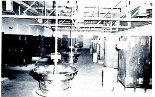
Locker rooms and showers