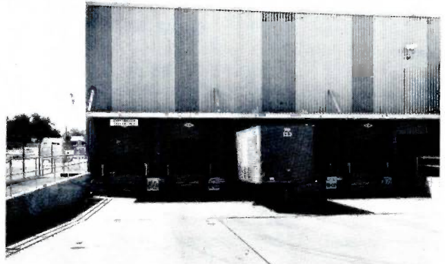
Outside loading docks

Phase 1 of the three-part Foundry improvement project has been completed. A 70-foot by 480-foot addition has been added to the east side of the brass and iron foundry building. This addition provides new storage areas, a centralized maintenance shop, new offices for Foundry Engineer, Jack Parsons; Brass Foundry Foreman, Bud Burner and Iron Foundry Foreman, Carl Schuman.